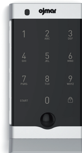
OCS®SMART Silver Handle