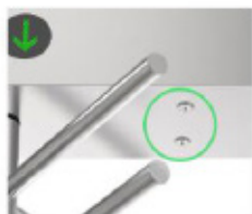
Manual control of entry direction