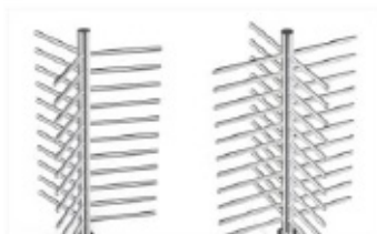
90°/ 120° Rotor Optional (three or four sections)