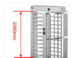
2080mm tall interior