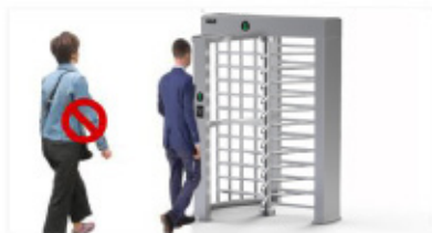
Anti-trailing function: Only one person can pass at a time